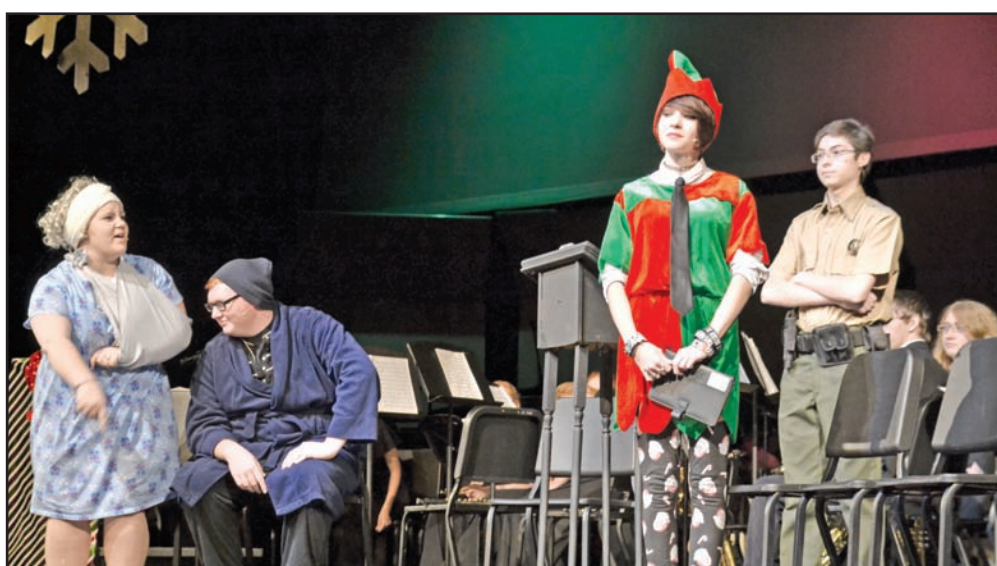
UCHS students held a trial after grandma got into an accident involving a reindeer.