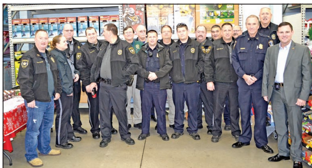
Blairsville Police Department got help from the Union County Sheriff's Office, the Blairsville Cruisers and friends.