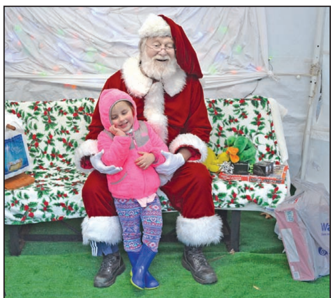
Santa Claus poses with a youngster at Vogel State Park.

To combat all the cold, Vogel broke out the metal bonfire bins, which only a couple of weeks back would